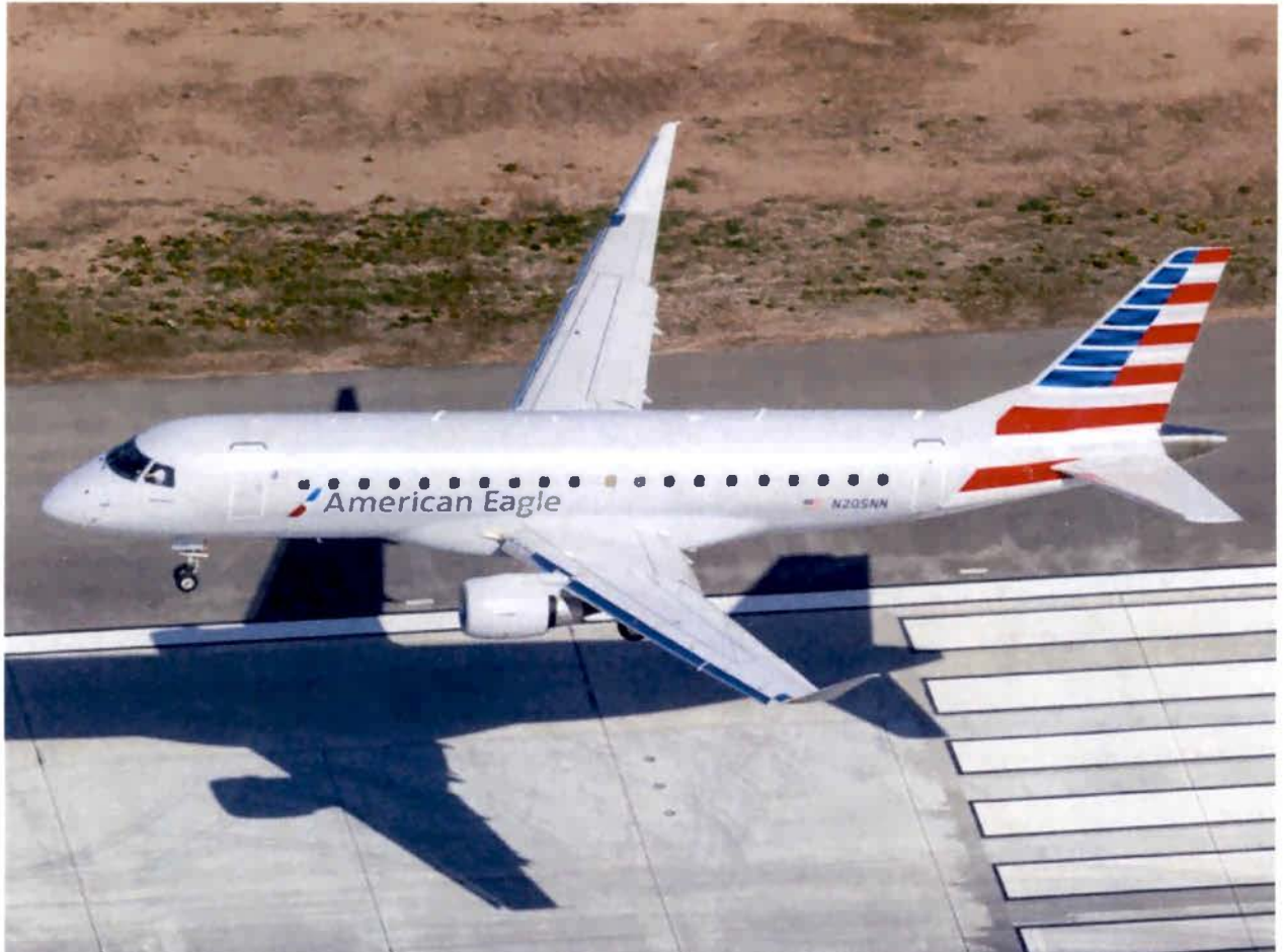
American Eagle regional aircraft.

Regional airports have become one of the biggest casualties of the coronavirus pandemic.